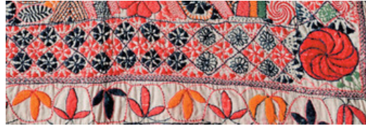
Kantha embroidered quilt (corner detail), ca. 1850–1900, Bangladesh or India, (Bengal) Faridpur District, cotton fabric, cotton thread, 28 3/4 x 28 1/2".