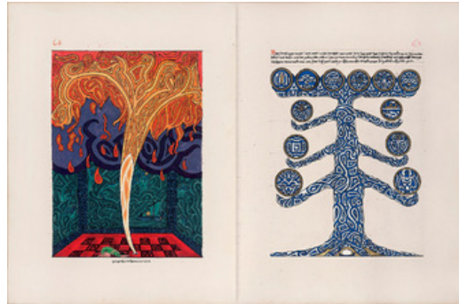
Two pages from Carl Jung's Red Book , 1914–30.