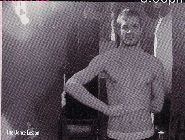
The Dance Lesson