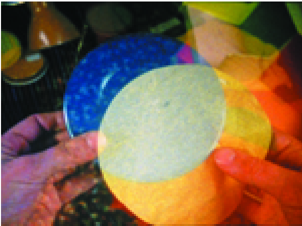
Untitled (Objects 3)

Monday, May 16, 2011 | 8:00 PM screening, $5 suggested donation